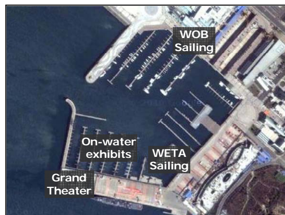
Qingdao Olympic Sailing Center - Activity Map

Don't miss this opportunity to find out what options there are to get out and have fun on the sea in Qingdao!